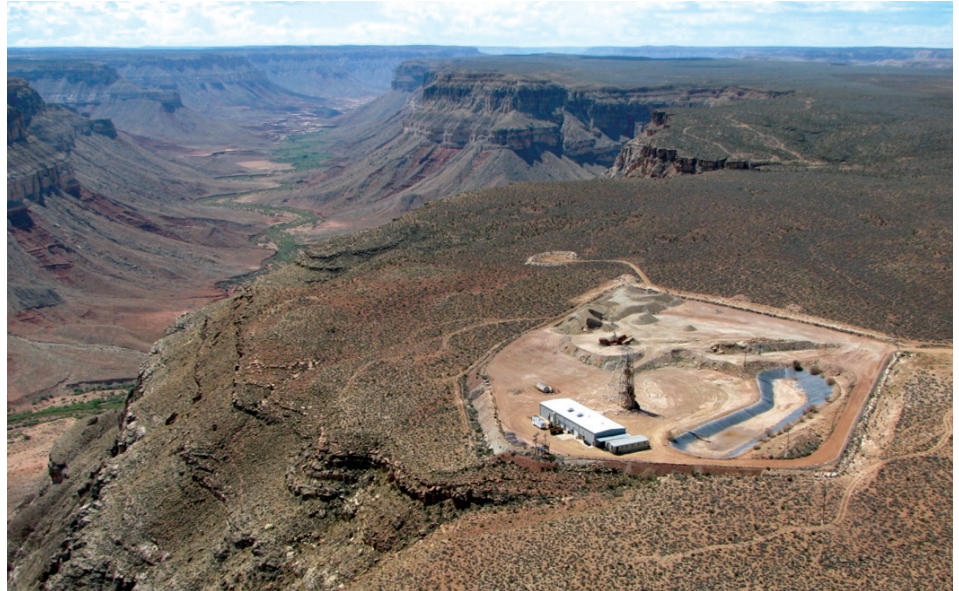
Figure 1. The Kanab North Mine is one of several breccia-pipe uranium mines in northern Arizona. USGS scientists conducted field assessments at this mine, where operations are currently on standby (USGS photo by Don Bills).

Citing concerns that uranium mining could have adverse effects on the Grand Canyon watershed, its people, and wildlife, on July 21, 2009, Secretary of the Interior Ken Salazar withdrew about 1 million acres of Federal land near Grand Canyon from new mining claims for 2 years. Mining of uranium can release toxic and hazardous substances to the environment. These include uranium itself, which is a toxic chemical and can pose a radiation hazard, and arsenic and other toxic trace metals. At the Secretary's request, the U.S. Geological Survey (USGS) conducted a series of short-term studies to examine the effect of breccia-pipe uranium mining in the region. USGS