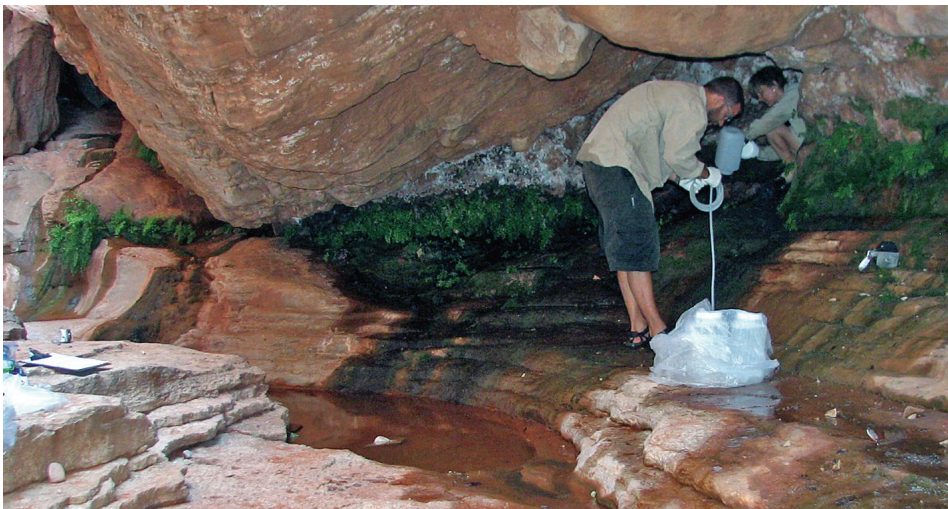
Figure 4. USGS scientists taking a water sample at Buck Farm Spring, which was 1 of 20 springs sampled as part of new research to investigate possible impacts of uranium mining in northern Arizona. Sites selected for sampling were designed to fill gaps in historical water-chemistry data in the region.

ions and trace elements, such as arsenic, iron, lead, and sulfate.